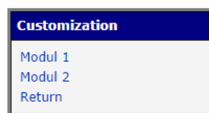
Figure 1: Menu of the Band Select user module for a router with two cellular modules

The web interface available for configuration of the Band Select user module can be invoked by pressing the module name on the User modules page of the router's web interface. The left part of the web interface (i.e. menu) contains only the Return item, to switch back to the router's web interface. In case of routers with two cellular modules, there are Modul 1 and Modul 2 items available to manage both cellular modules of the router separately.