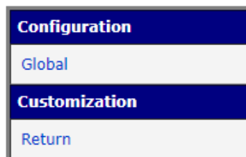
Figure 1: Main menu

Left part of this GUI contains menu with Configuration menu section. Customization menu section contains only the Return item, which switches back from the module's web page to the router's web configuration pages. The main menu of module's GUI is shown on Figure 1.