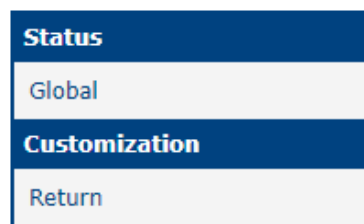
Figure 1: Menu

Left part of this GUI contains menu with Status menu section and Customization menu section. Customization menu section contains only the Return item, which switches back from the module's web page to the router's web configuration pages. The main menu of module's GUI is shown on Figure 2.