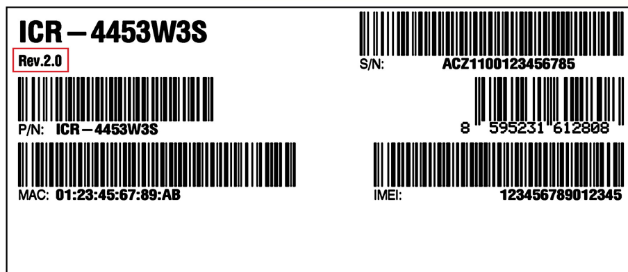
Figure 1: Revision on the Packaging Label