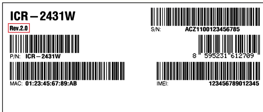
Figure 1: Revision on the Packaging Label