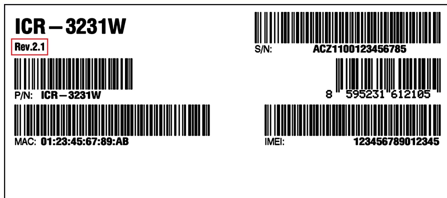
Figure 1: Revision on the Packaging Label